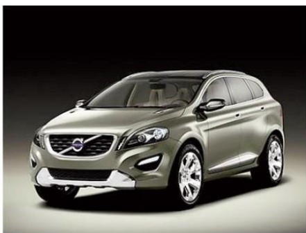
FIGURE 1 Volvo XC60 and Volvo XC90

We begin by proposing a taxonomy that assigns consumers to one of four groups on the basis of two distinct and measurable characteristics: wealth and need for status. According to the Pew Center for Research (Allen and Dimock 2007), almost half of all Americans view their country as being divided into two classes: the haves and the have-nots. Thus, first we divide consumers into the relatively well-to-do and everyone else. Dubois and Duquesne (1993) find that the higher a person’s income, the greater is that person’s propensity to purchase luxury goods; thus, luxury goods manufacturers are most concerned with how preferences vary among those who have more.