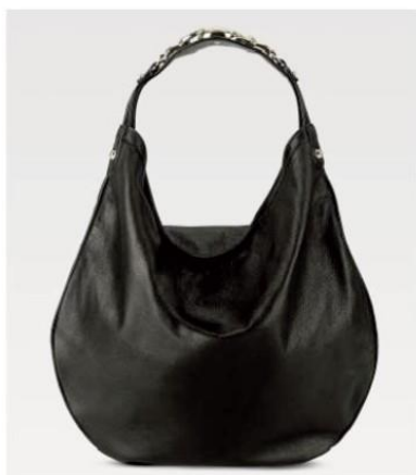
Gucci Handbag No. 170 Average Loudness Rating = 7 Price: $1,150