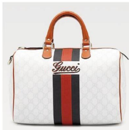
Gucci Handbag No. 120 Average Loudness Rating = 1 Price: $640

(anchored at the extremes by “not at all” and “a great deal”) on the following criteria: